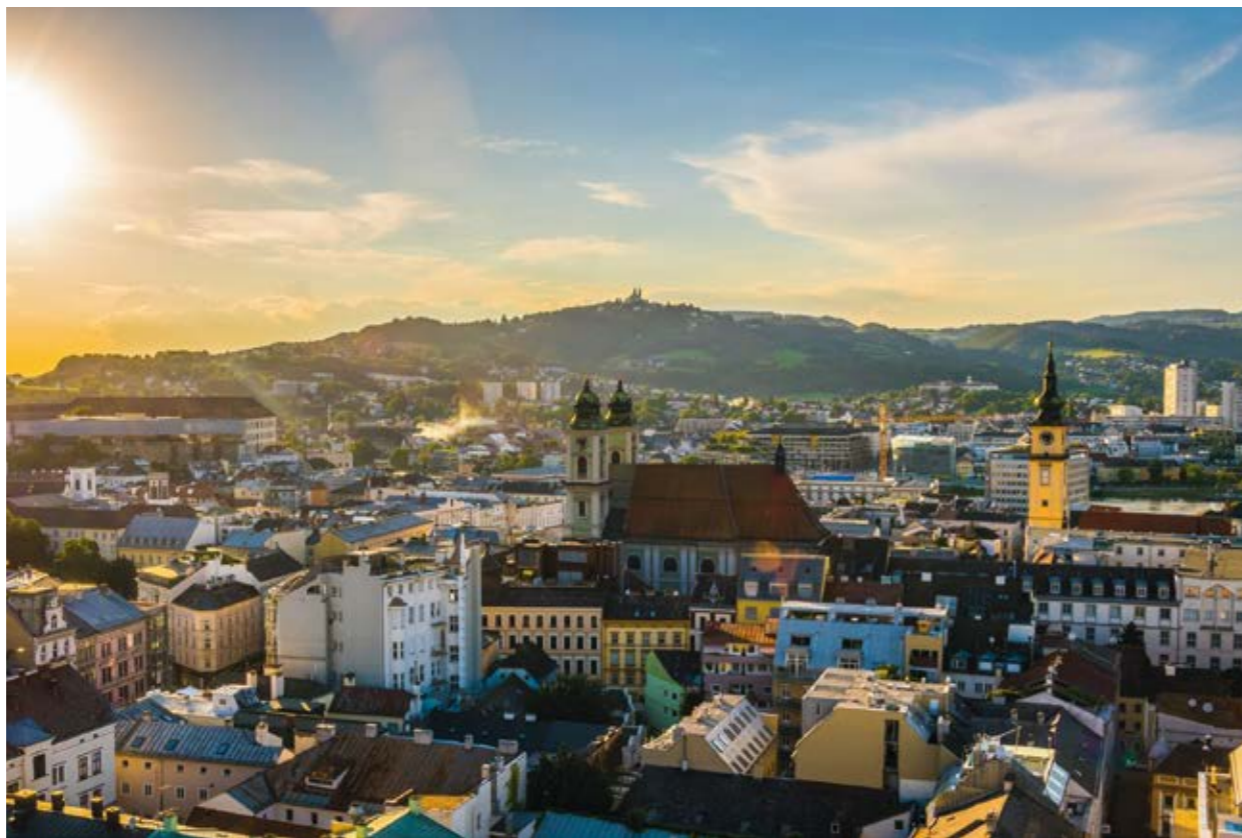
LINZ The city that lives its changeability and where the unknown can be found in familiar places.

With its gentle rolling hills and highlands with spectacular views, the Hausruckviertel in Upper Austria is the best destination for nature lovers and hikers. The Hausruck hills may lend their name to the region and offer magnificent views, but it is the ever-changing city of Linz that lies at the heart of the Hausruckviertel. The city never stops to take a breath, is constantly changing and welcomes these changes with open arms. The highs and lows of its history, the city centre with its sensational architecture and the sophisticated specialities are what make Linz so special. But the locals don't harp on about it, they would rather look ahead and find their zest for life in the here and the now. The 2009 European Capital of Culture and UNESCO City of Media Arts is one of a kind. It is home to a vibrant contemporary cultural scene, the most modern opera house in Europe and many international companies. Young entrepreneurs have breathed life into the Old Town, which boasts a wide array of things to do for people of all ages alongside sensational green spaces and spots with stunning views.